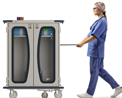
Handle swings up to ideal height.