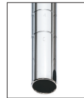
Post for Stem Caster