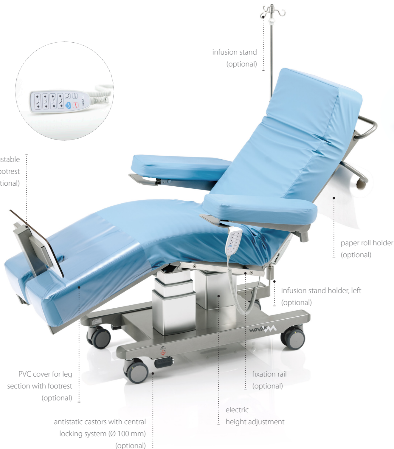
infusion stand (optional)