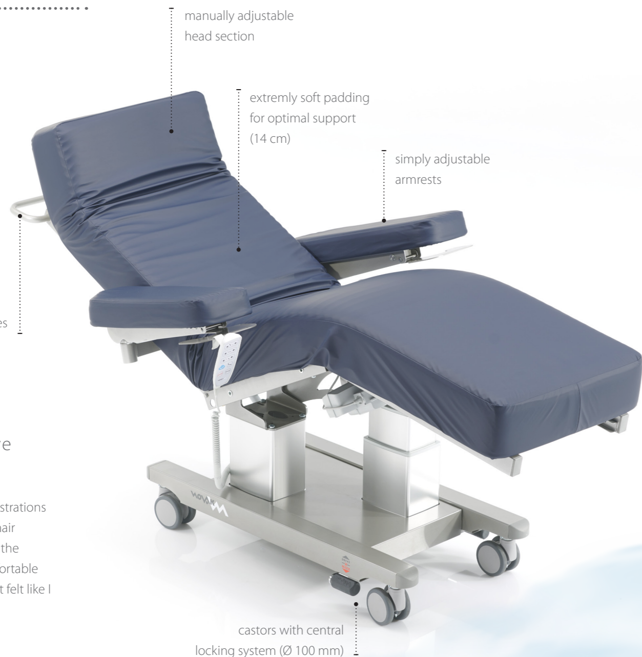
manually adjustable head section