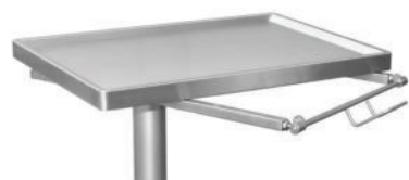
E-01KO with a removable top