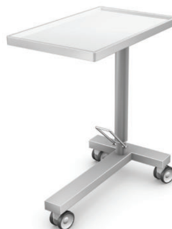
Option: a table equipped with double castors of 100 mm diameter