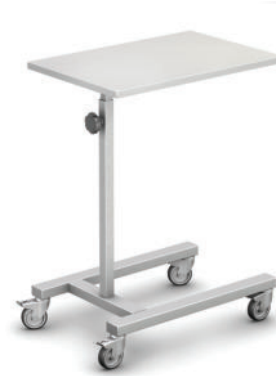
E-02KO (FR) with a flat top

Total dimensions: 600 x 400 x 900-1500 mm [L x S x H] Top dimensions: 600 x 400 mm [L x S]