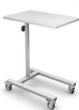
E-02ST (FR) with a flat top