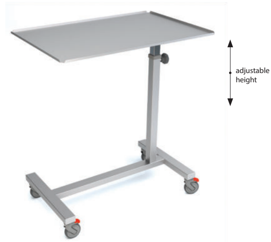
E-02KO with lifted up edges