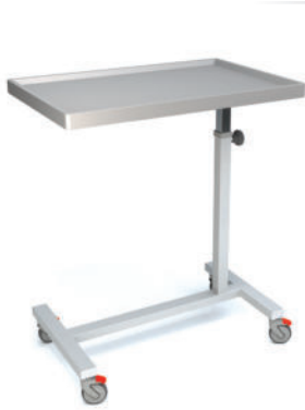
E-02ST with a deepened top